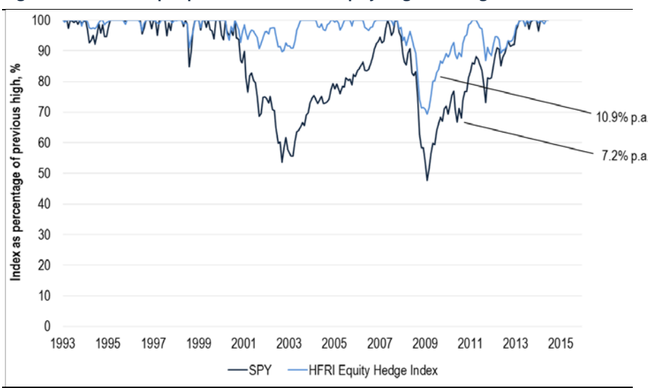
Figure 2: Under water perspective - SPY versus Equity long/short hedge funds

"It requires a great deal of boldness and a great deal of caution to make a great fortune, and when you have it, it requires ten times as much skill to keep it." —Ralph Waldo Emerson (1803-82), American essayist